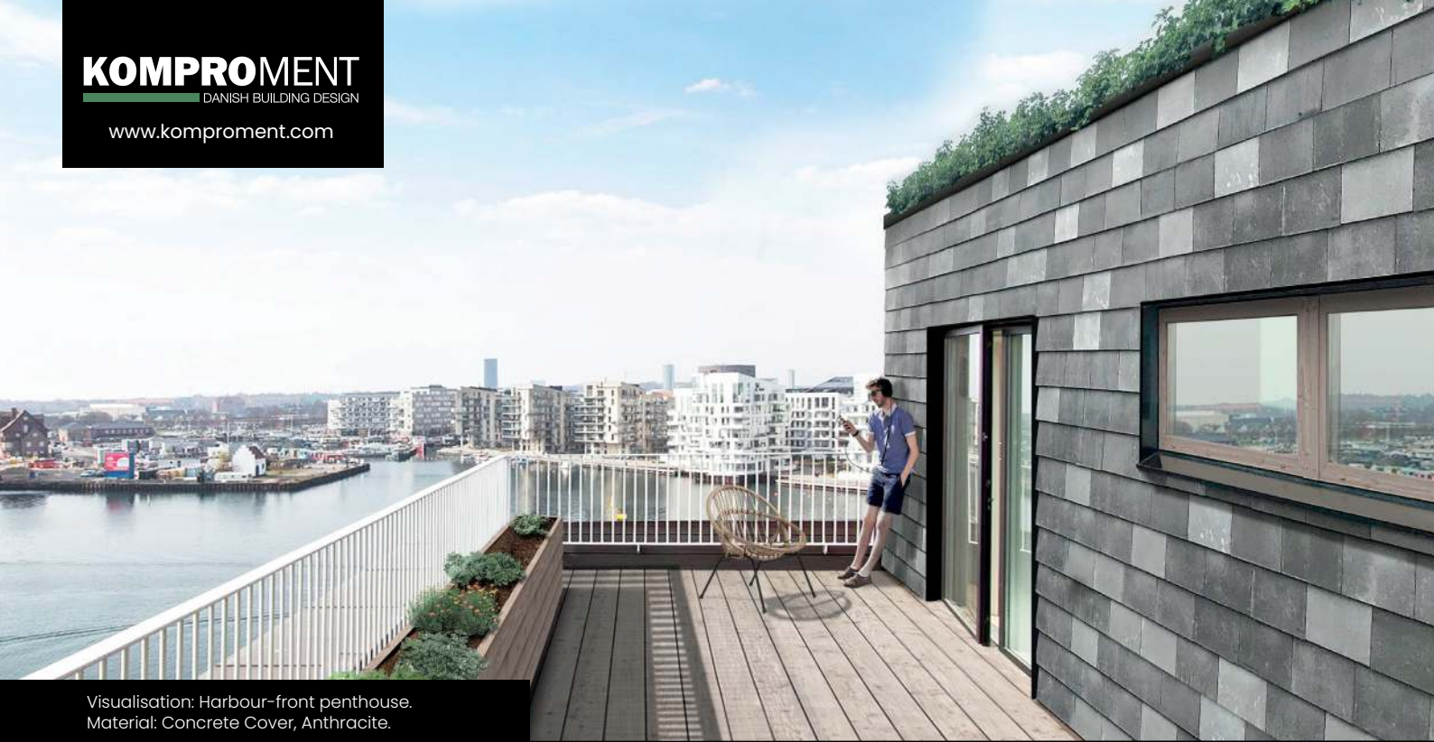
Visualisation: Harbour-front penthouse. Material: Concrete Cover, Anthracite.