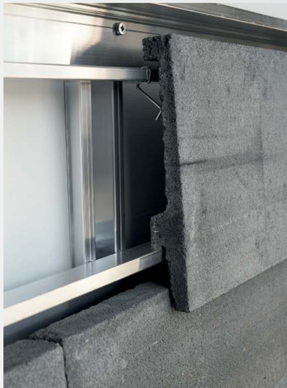
Detalj: Monterad sten

COLOUR: STANDARD (GREY) + 3 SPECIAL COLOURS