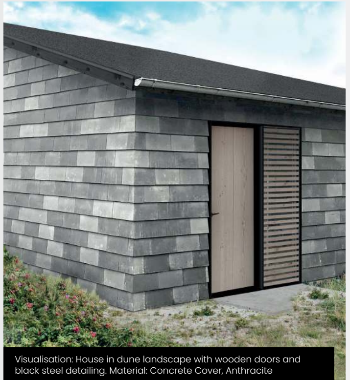
Visualisation: House in dune landscape with wooden doors and black steel detailing. Material: Concrete Cover, Anthracite